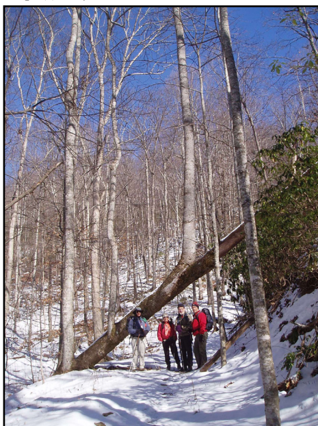
Angled tree on Pounding Mill Trail.

Only Meeting Place: Asheville Outlets parking lot behind Waffle House off Exit 33 of I-26. Limit of 15 hikers, contact hike leader via email for reservations. This is a combination of CMC hikes #20 and #21. The hike will start at Walnut Cove Overlook, going 1.8 miles to Sleepy Gap. We will continue on the MST from Sleepy Gap to the Chestnut Cove Overlook for another 0.9 miles, and then return to Walnut Cove Overlook. Topo(s): Skyland